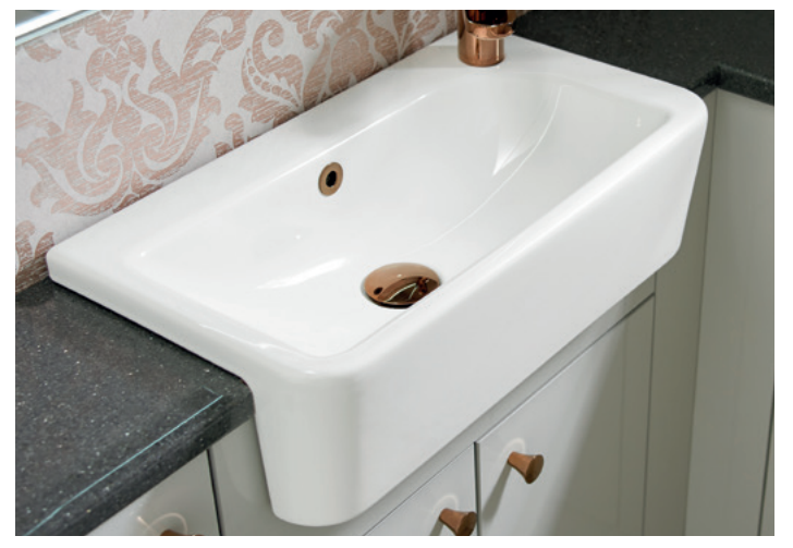
Rose Gold overflow ring is an optional extra.